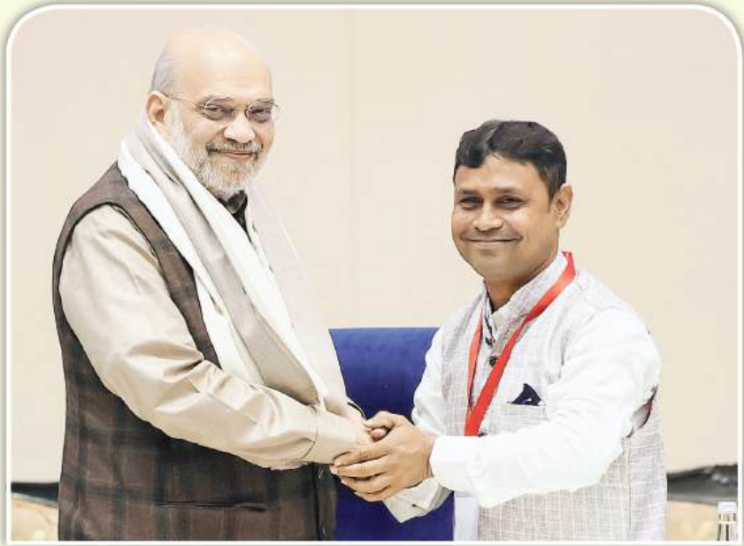
A sarathi (driver) welcomes Union Minister for Home and Cooperation Shri Amit Shah, during the launch ceremony of Bharat Taxi.

Bharat Taxi is promoting women's safety and empowerment through initiatives such as "Saarthi Didi" and